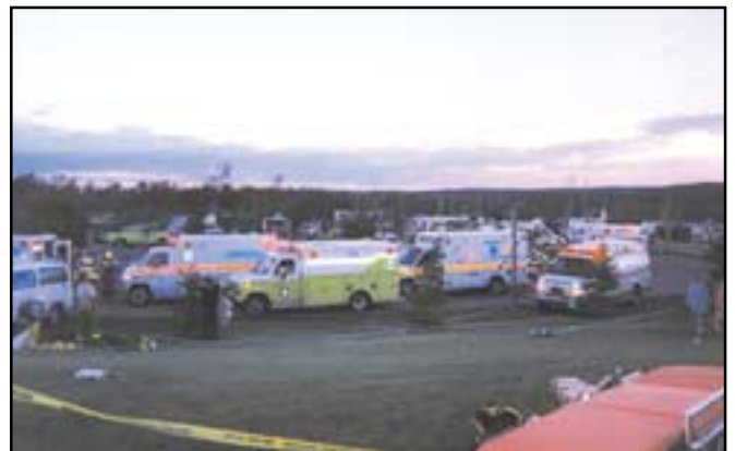
The above photos, taken shortly after the tornado hit, show the incredible level of response by emergency workers from across the province.